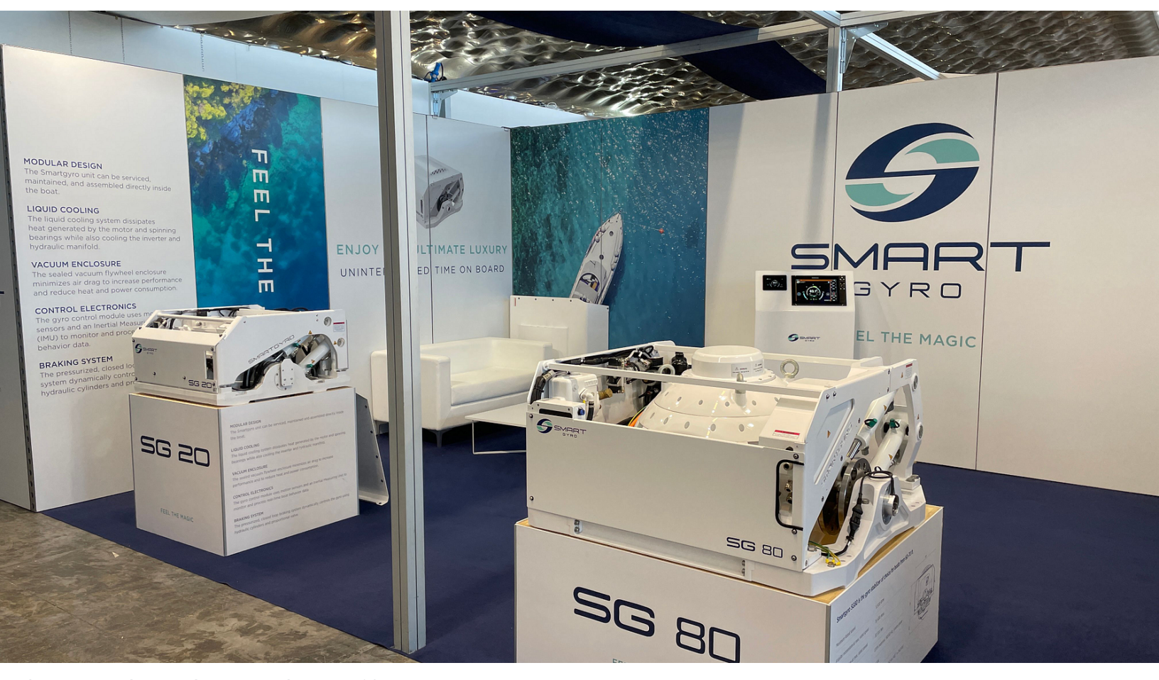
Genoa Boat Show - Smartgyro Stand TL10