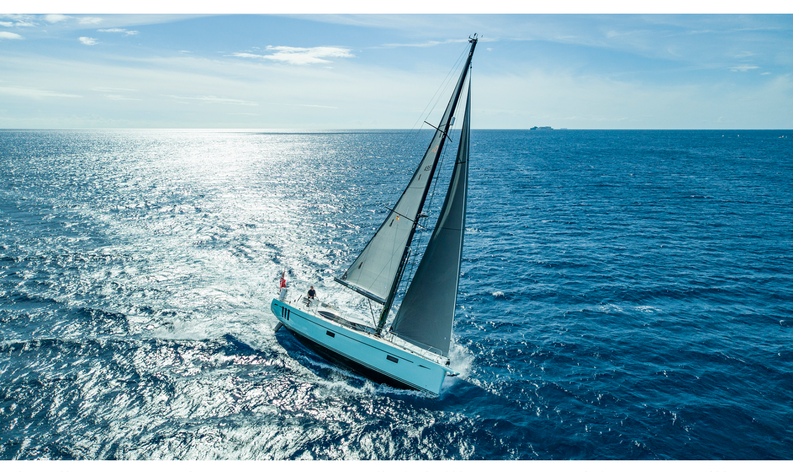
Oyster 495 hull number one, Carpe Diem, is powered by the YANMAR 4JH110 diesel engine, with SD15 sail drive and VC20 controls