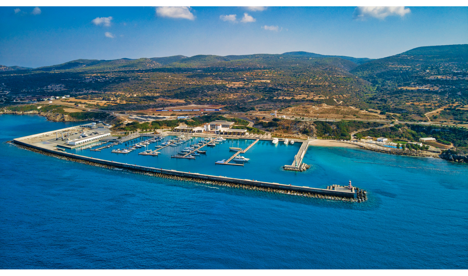
The Karpaz Gate Marina resort in North Cyprus is launching additional amenities including a Yacht Club and new leisure and technical facilities