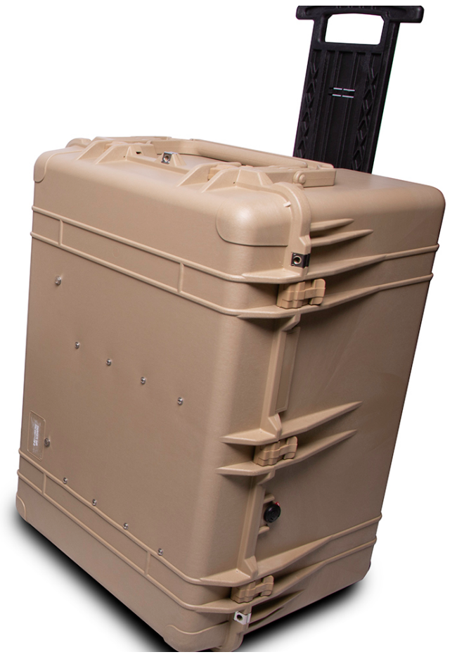
H2O PRO Reverse Osmosis System