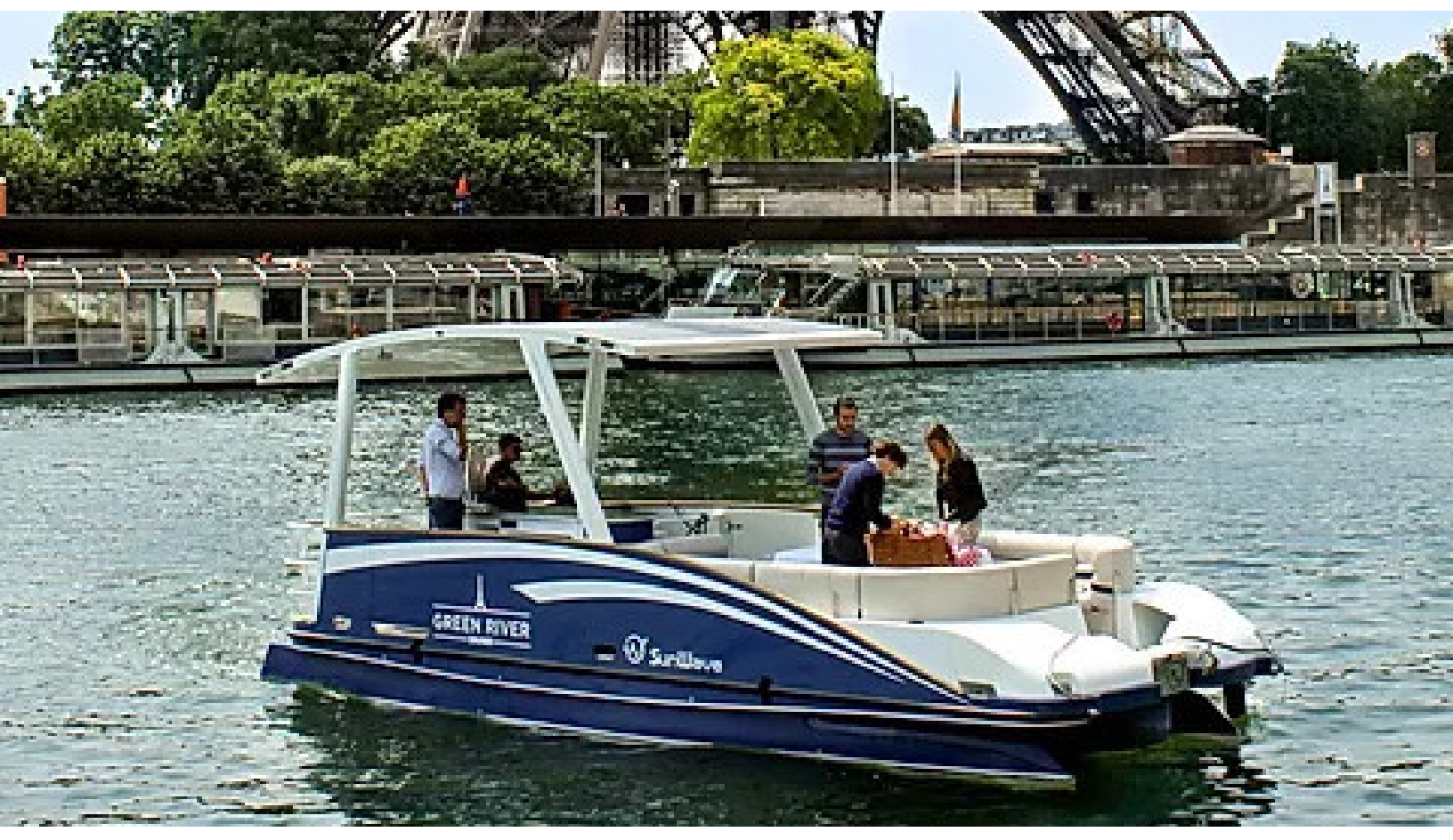
Fischer Panda UK can support applications similar to the new electric passenger boat operating on the Seine River, installed with a system from its brand Bellmarine