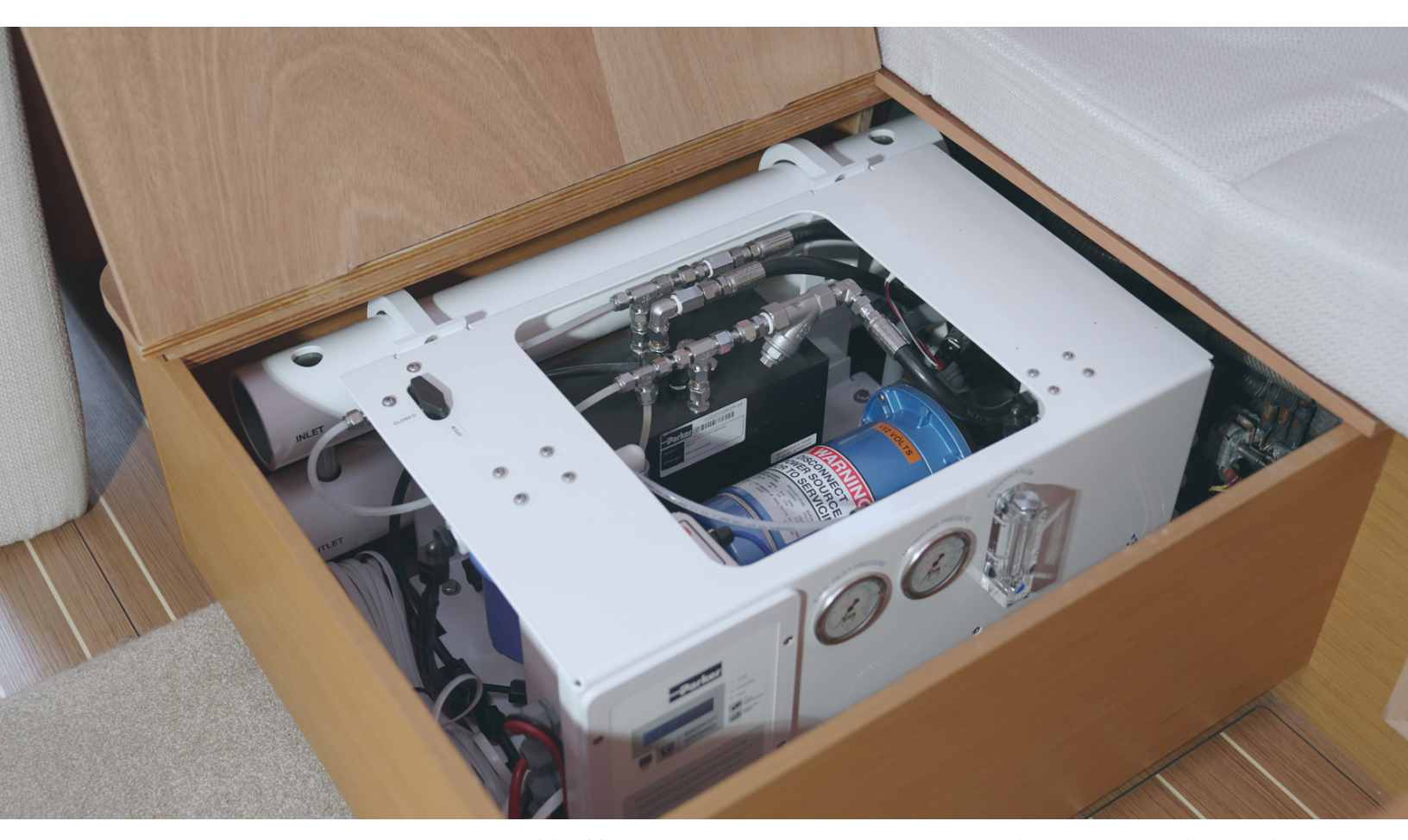
Fischer Panda UK installed the Parker Hannifin H20 ECO watermaker in a seat locker onboard 50ft sailing yacht Nimble Ape II